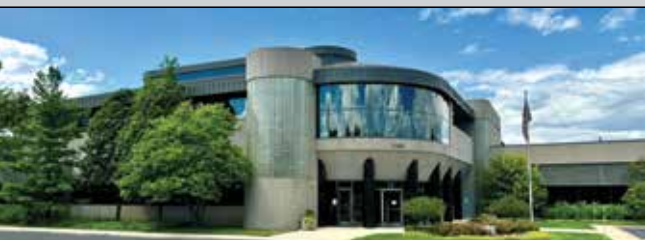
Our Global Headquarters in Waukegan, Illinois, U.S.A.

We cordially invite you to visit our modern manufacturing facilities in Waukegan, Illinois, USA; Mainz, Germany; Monteveglio, Italy; Dalian, China; and Diadema, Brazil.